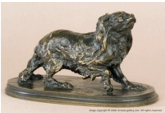
Chien King Charles, after P.J. Menecirca 1846 Sand Cast Bronze 3-1/2" x 5-7/8"

are also being produced. Today, a 19 th -century casting of this piece would sell for $600-$1,500.