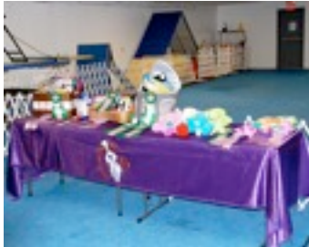
Another Beautiful Trophy Table

The CKCSCNENY conducted its second A/OA Match, Saturday November 13, 2010, an important step in the road to recognition by the American Kennel Club. The venue for this indoor event was the lovely training facility for the Schenectady Dog Training Club in Scotia, N.Y. As expected, there was excellent support in members, exhibits and refreshments. Everything ran smoothly and on time.