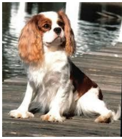
CH Ravenrush Tartan ROM LOM

Chances are, if you look at your pedigrees today and trace them back, you will find a Ravenrush cavalier proudly standing there.