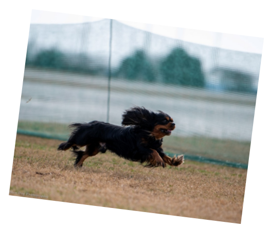
Top 10 Cavalier Fast Cat participants Year To Date. Look At Those MPH! WOW!