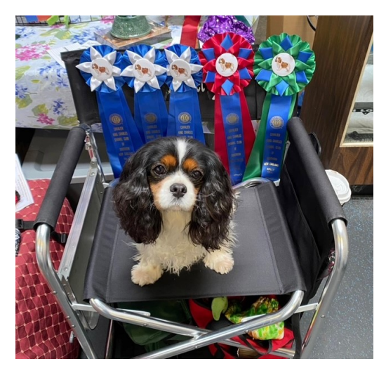
Chadwick Simply Gorgeous

13 year old Precious- New TKN Title Holder!